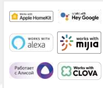
Open Platform Compatibility