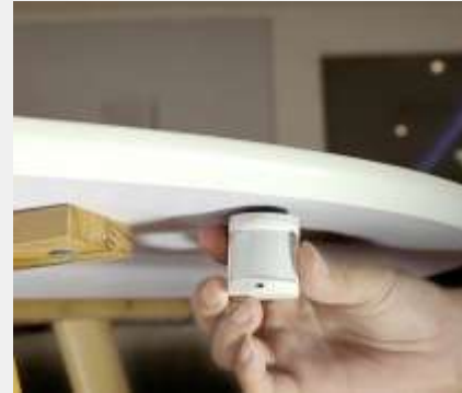
Award-winning Designs & Easy Installation