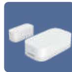
Door & Window Sensor