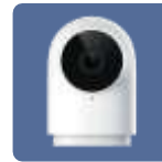
Camera Hub G2H