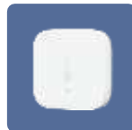
Temperature & Humidity Sensor