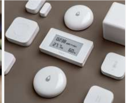
Comprehensive Product Offerings