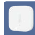
Temperature & Humidity Sensor