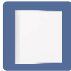
Wireless Remote Switch