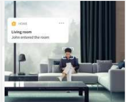
Superior Technology Utilizing Zigbee & AI