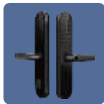
Smart Door Lock